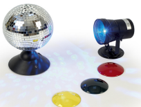
Pinspot and Mirror Ball

Please note: The battery will be upside down on receipt, please insert the correct way before use.